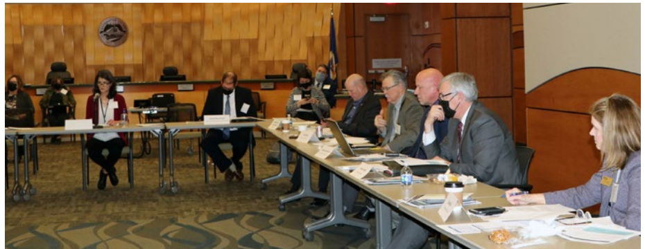
Washington County commissioners met with legislators who represent the county in mid-January to review the county's legislative agenda.