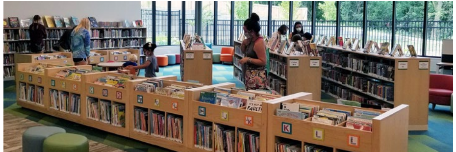
The County Board eliminated processing fees charged to users to assure better access to county libraries.

Because processing fee charges remained on accounts even after overdue items were returned or