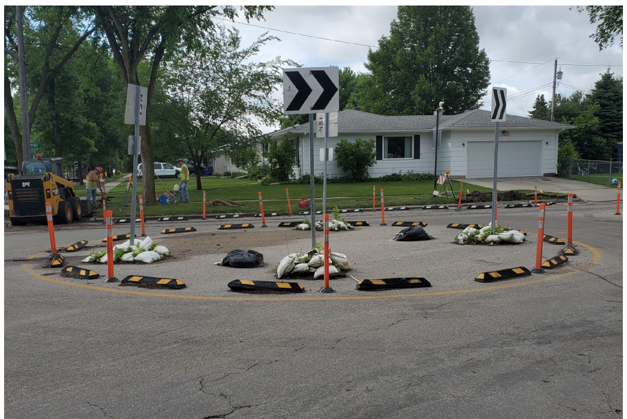
Example of temporary roundabout